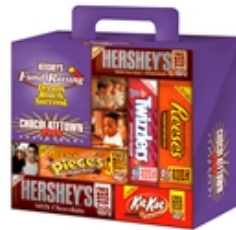
Hershey's Chocolatetown Plus