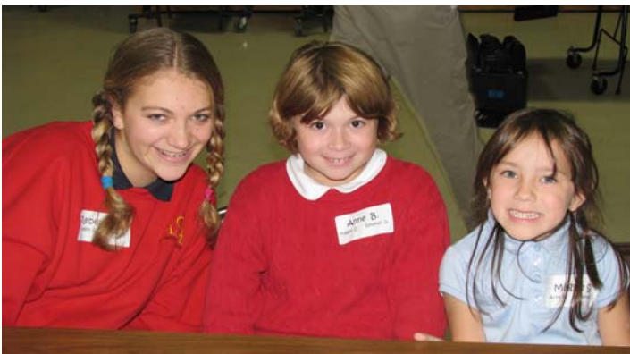
Buddies work on their projects together