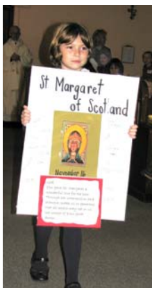
Introducing our Saints during Mass