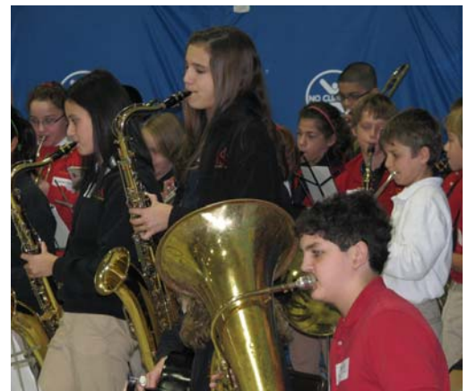
Our Middle School Band entertains us while we are getting ready for our Buddy Project with "Louie, Louie" and "When the Saints go Marching In."